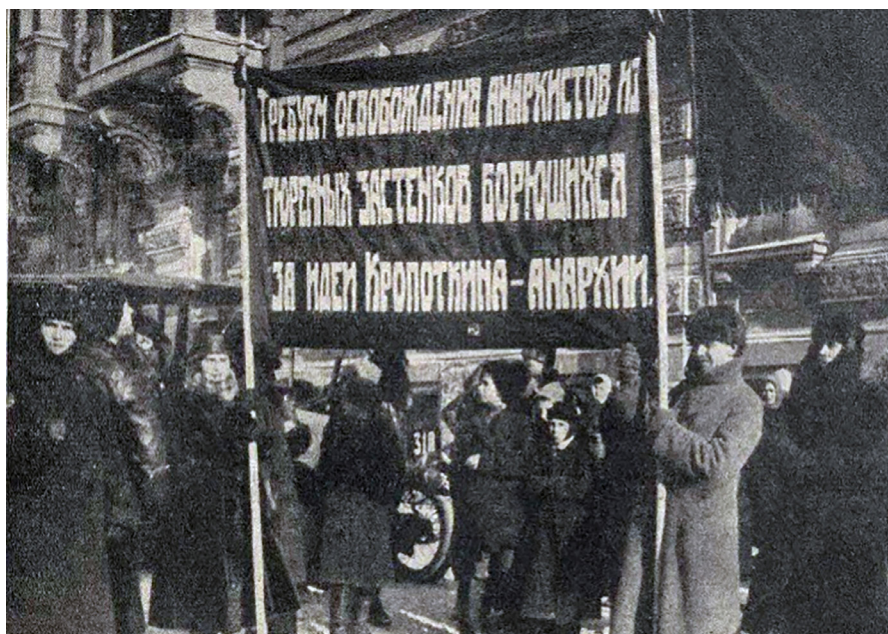
The banner reads: "We demand the release from prison dungeons of anarchists struggling for the ideas of Kropotkin—Anarchy."

The procession arrived at the Novodevichy Cemetery, where a