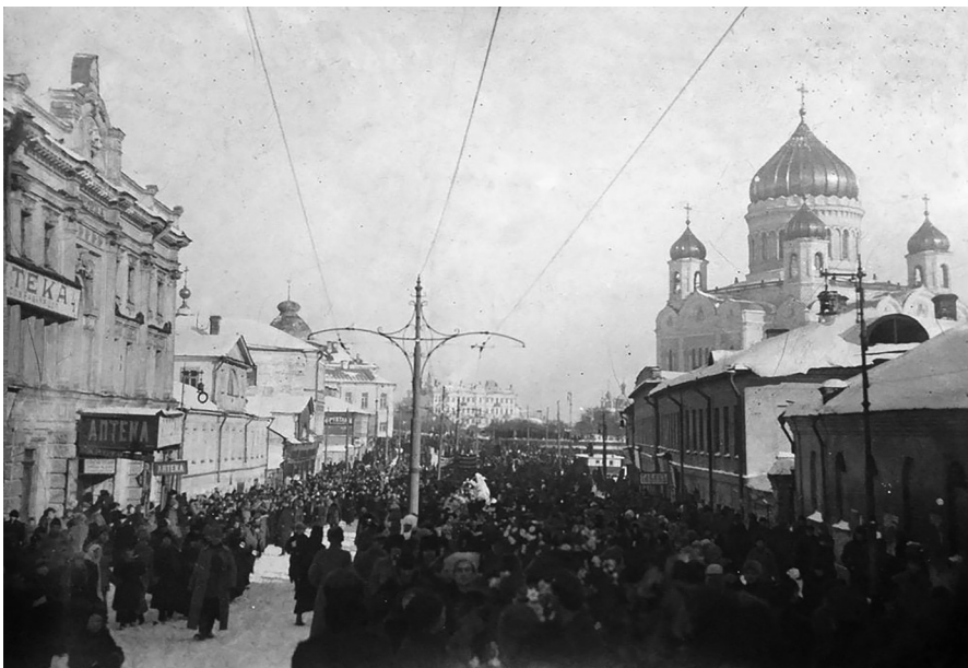
The procession passed along Prechistenka Street, lined by the former mansions and manors of the nobility.

Finally February 13 arrived, the day of the funeral. From early morning, solemn columns of mourners gathered