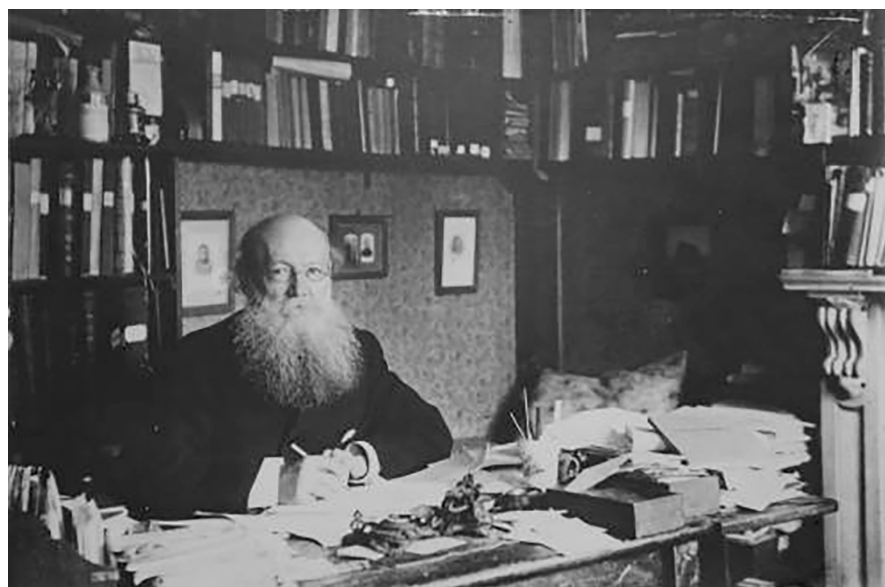
P. A. Kropotkin in his study in Dmitrov, sitting at a desk he built with his own hands.

But this did not prevent him from taking the side of the Provisional Government on the “Ukrainian question”: without looking into the basic demands of the Ukrainian national liberation movement and, in particular, the resolutions of the Ukrainian Central Rada, the confirmed federalist Kropotkin wrote an emotional letter, echoing federalists from Ukraine, with the appeal “Don’t sever age-old ties!” Mind you, the letter never reached the addressees, but that was the result of a decision of members of the Provisional Government, who were just leaving for negotiations in Kiev.