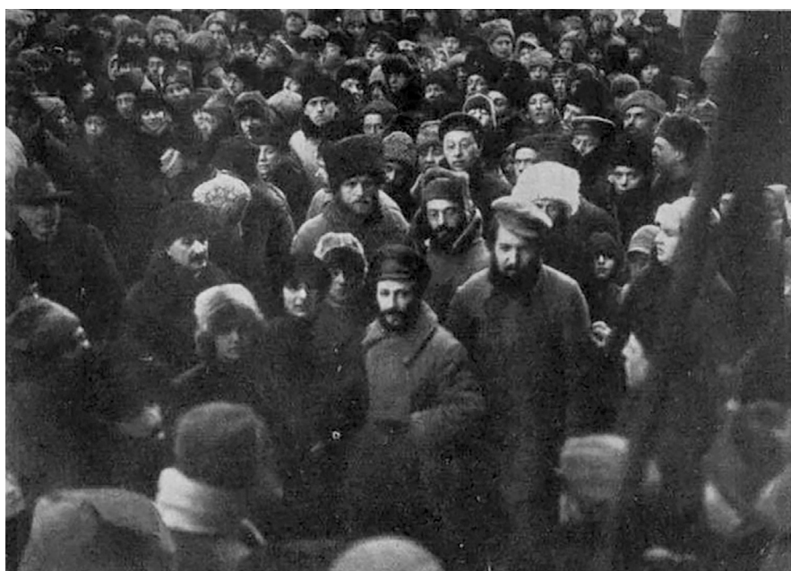
The seven released prisoners are in the centre of the crowd.