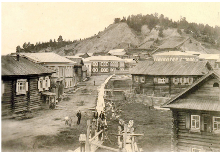
Samarovo in 1909 – the residents are showing off their new wooden sidewalk.

Translated and annotated by Malcolm Archibald