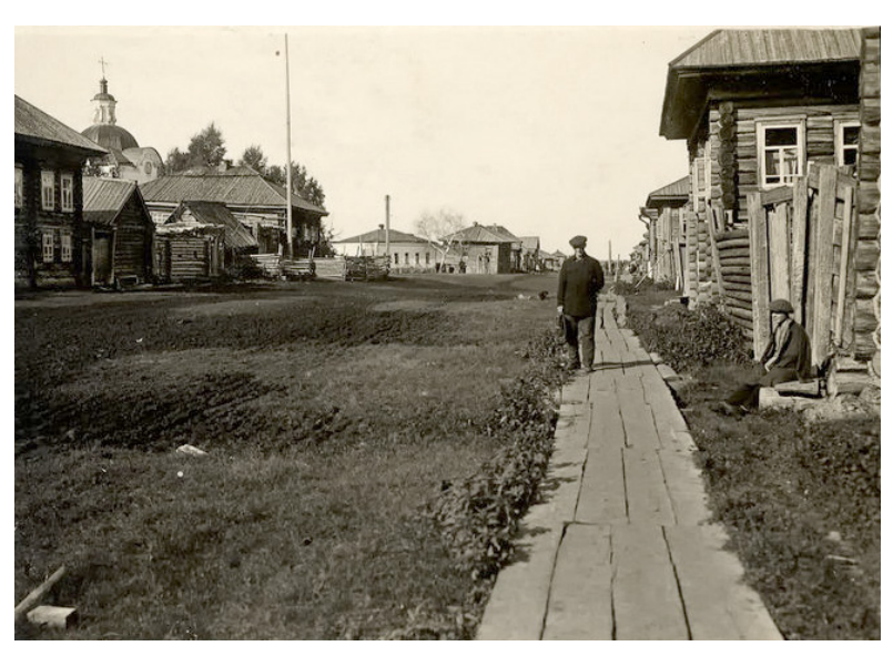
Main Street of Narym - 1930s.

Within a short period of time, we, the anarchists,