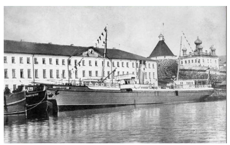
The "Gleb Boky" moored at the main administration building of the Solovki camps (Solovetsky Kremlin in the background). The vessel had formerly belonged to the monastery and was rechristened with the name of a prominent Cheka official. The prisoners had their own name for it: "Charon's Ferry."

Since the 6 rubles 30 kopecks issued monthly to political exiles was sufficient only for tobacco, all of us anarchists worked: some on building a cannery (re-purposing a church), replenishing stocks of firewood (in winter), and haymaking (in summer). We had to register with the GPU twice a week. Each political exile had to sign an undertaking that they would not venture